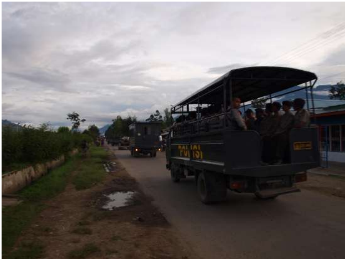
Photograph 3: Police and Army turn out en masse to shut down a church celebration in Wamena, 2008

approximately 20 open backed police and army vehicles, packed with at least ten troops and officers each, driving around the town with their sirens blaring, then parading before shutting down a West Papuan church-opening ceremony (see Photograph 3). That “the surprise appearance of a large unit of specially equipped police in full view of the mob can have a huge psychological impact” 87 was confirmed by this author in Wamena when one of the rapidly scattering crowd of celebrators whispered that the security forces shut down the town and cut off roads like this regularly as a drill.