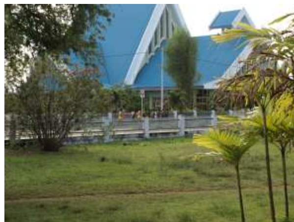
Photo 2: TNI troops singing loudly while jogging past a church in Merauke, 2008

According to Watson, "crowd-control is probably the most-used psychological counter-insurgency technique. ... The effects of police formations and actions on crowds and the use of special equipment and techniques ... produce desired effects". 85 This technique is exercised frequently in West Papua by security forces via "sweeps" of towns and villages searching for "separatist" materials or weapons on politically important West Papuan dates such as December 1 st (West Papuan national day), 86 and the turning out en masse of security forces to incite awe and fear. For example, when in Wamena in 2008, one of the authors was witness to the sudden and unnerving show of