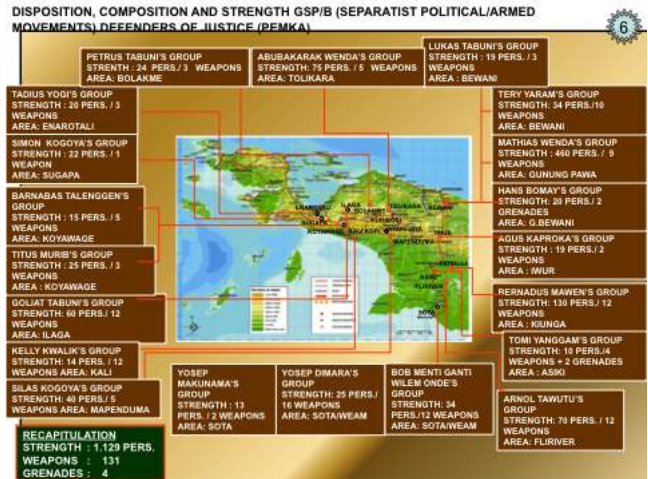
Figure 1: Slide 6, Anatomy of Papuan Separatists