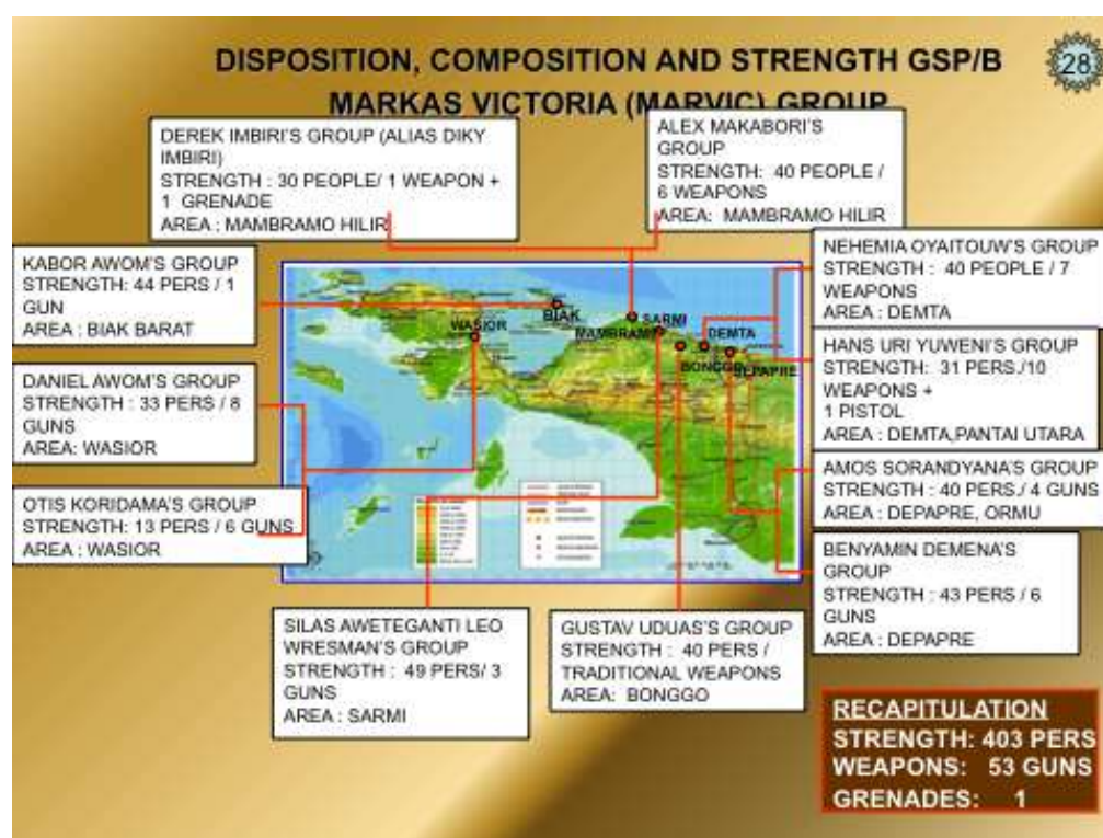
Figure 3: Slide 28, Anatomy of Papuan Separatists

Slide 28, reproduced below, shows the “Disposition, Composition and Strength of GSP/B Markas Victoria (MARVIC) group”. 15 There are 11 groups consisting of 403 persons with 53 guns and one grenade. These groups are, on the whole, smaller and less active than the PEMKA groups. The largest group is the Sarmi command under Silas Awete, although no activity is recorded for this group since 2004. Three commands have no bio-data; their files containing only the statement “there have been no conspicuous actions as of yet”.