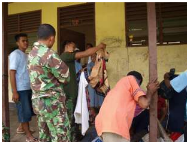
Photo 1: TNI troops with second-hand clothes brought by a Merauke church to villagers, 2008

Similarly, Jacob Rumbiak writes: "Psychologically, chronic oppression causes depression and a feeling of powerlessness". 84 From the TNI houses that are wedged between Papuan houses in Papuan villages and TNI checkpoints at the entrance to villages, to the strategic placement of terrifying statues of Kopassus troops in public places, West Papuans are made to feel the presence of Indonesian security forces in their everyday activities. One of the authors observed during a visit to West Papua in 2008 that Indonesian troops even monitored church services (as depicted in one of the leaked TNI PowerPoint files) and church-provided clinics. Further asserting their presence, the TNI commonly take early morning runs, singing nationalistic songs loudly as they jog (this was observed numerous times by one of the authors in 2008 in West Papua—see Photograph 2, below). This practice is also common in Java, but in West Papua it is particularly disturbing as it serves as a reminder at the beginning of the day of who exercises authority in the public arena in West Papua.