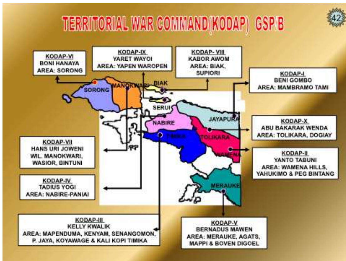
Figure 4: Slide 42, Anatomy of Separatists